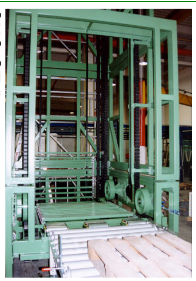
Design for Euro pallets

The supporting frame of the heavy-duty conveyor is a robust construction made from aluminium profile sections that are bolted together. In compliance with local requirements, it is provided with cladding of perforated aluminium sheets. Generously sized access doors allow easy access for maintenance and cleaning. The conveyor platforms of steel profiles are mounted on the rubber block chains. A spurgeared motor drives the shaft via a transmission chain. The drives are designed for operation with a frequency converter to provided by the customer. The switchgear can be wired to terminal boxes. Optional equipment available are the PLC control as well as the feeding and discharging conveyors.