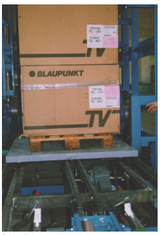
Design for roller pallets

The supporting frame of the heavy-duty conveyor is a robust construction made from aluminium profile sections that are bolted together. In compliance with local requirements, it is provided with cladding of perforated aluminium sheets. Generously sized access doors allow easy access for maintenance and cleaning. The conveyor platforms of steel profiles are mounted on the rubber block chains. A spurgeared motor drives the shaft via a transmission chain. The drives are designed for operation with a frequency converter to provided by the customer. The switchgear can be wired to terminal boxes. Optional equipment available are the PLC control as well as the feeding and discharging conveyors.