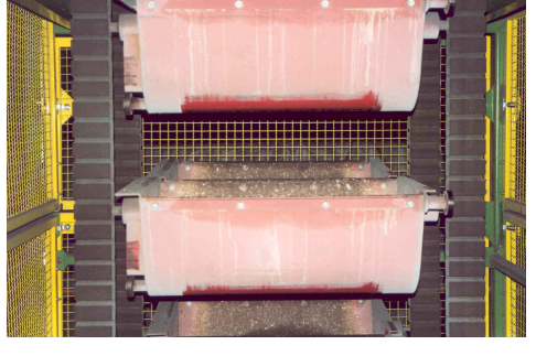
Overlapping buckets in the horizontal, Separated single buckets in the vertical.

Come to NERAK for a solution to your conveying problem – quality assured success!